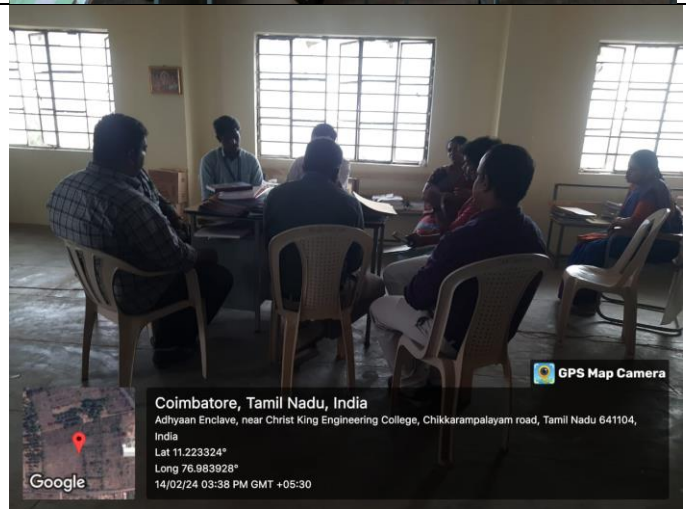
Fig: Academic audit ATR meeting among the faculties

[Handwritten Signature] IQAC Coordinator